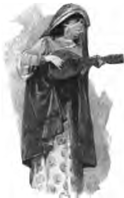
“WAITED, TREMBLING, FOR THE MINUTE.”

A mask that leaves but one eye free, To do its best in witchery,— She roved, with beating heart, around, And waited, trembling, for the minute, When she might try if still the sound Of her loved lute had magic in it.