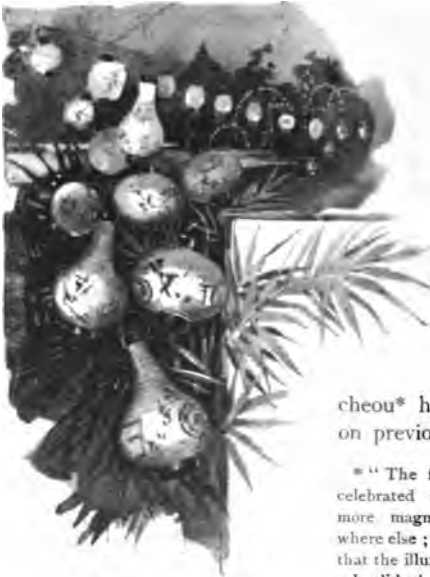
"THOUSANDS OF SILKEN LANTERNS."

ON their arrival, next night, at the place of encampment, they were surprised and delighted to find the groves all around illuminated; some artists of Yamtcheou* having been sent on previously for the pur-