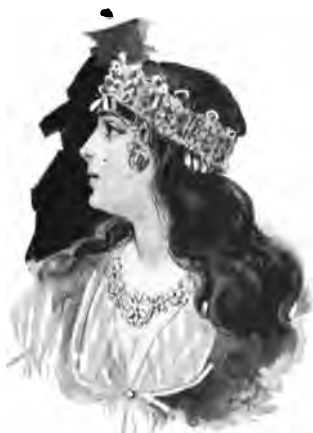
“HIS YOUNG NOURMAHAL.”

But that loveliness, ever in motion, which plays Like the light upon autumn's soft, shadowy days,