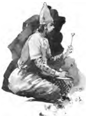
“THE BEAT OF TABORS.”

The moon had never shed a light So clear as that which bless'd them there ; The roses ne'er shone half so bright, Nor they themselves looked half so fair.