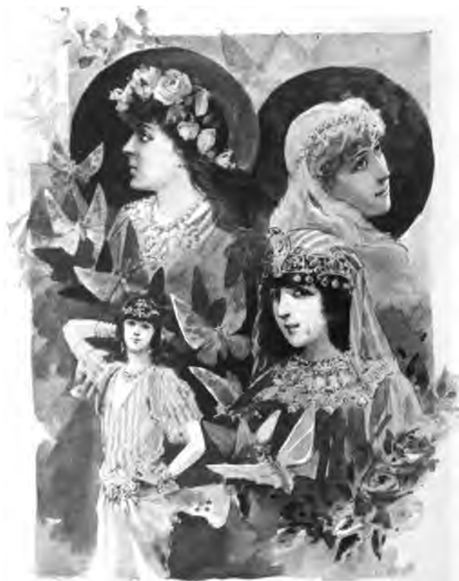
"DAUGHTERS OF LOVE."