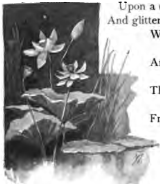
“THOSE VIRGIN LILIES.”

Upon a column, motionless And glittering like an Idol bird!— Who could have thought, that there, ev'n there, Amid those scenes so still and fair, The Demon of the Plague hath cast From his hot wing a dead- lier blast, More mortal far than ever came From the red Desert's sands of flame! So quick, that every living thing