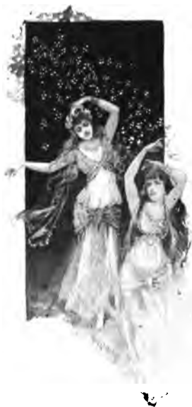
“MID SHOWERS OF JESSAMINE.”

Thus bright to my soul, as 'twas then to my eyes, Is that bower on the banks of the calm BENE- MEER!