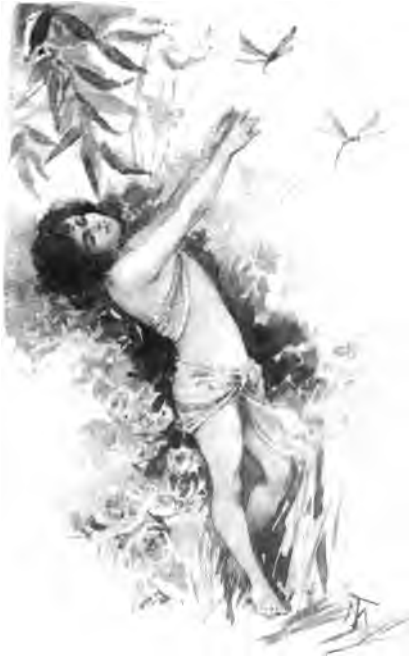
"CHASING, WITH EAGER HANDS AND EYES."

Chasing, with eager hands and eyes, The beautiful blue damsel-flies,*