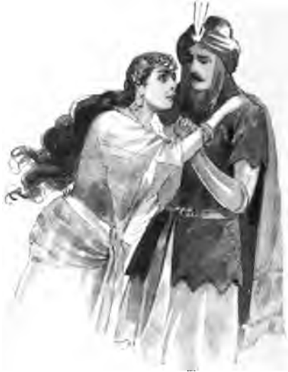
“ SHE CLINGS AROUND THE WONDERING CHIEF.”

“ Why, when I saw the prize that chance “ Had thrown into my desperate arms,— “ When, casting but a single glance “ Upon thy pale and prostrate charms,