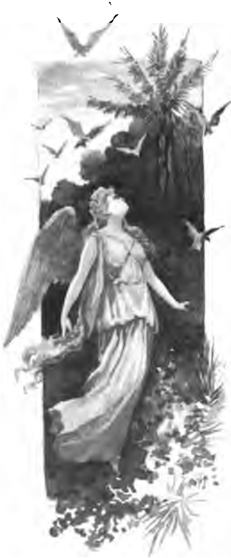
"HANGS LISTENING TO THE DOVES IN WARM ROSETTA'S VALE."

Is hidden from the sons of earth Deep in those solitary woods, Where oft the Genii of the Floods Dance round the cra- dle of their Nile, And hail the new- born Giant's smile.*