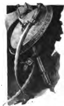
"COLD, SUNLESS RELICS."

One sole desire, one passion now remains, To keep life's fever still within his veins,—