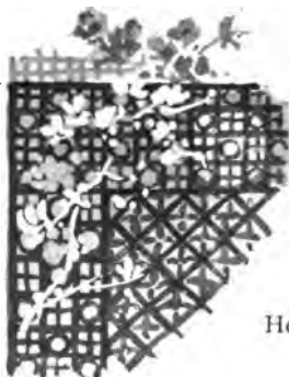
"THE LATTICE, WREATH- ED WITH WOODBINE."

And she had pledged her powerful art,— Pledged it with all the zeal and heart Of one who knew, though high her sphere, What 'twas to lose a love so dear,— To find some spell that should recall