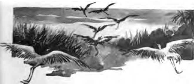
" EACH BRILLIANT BIRD."