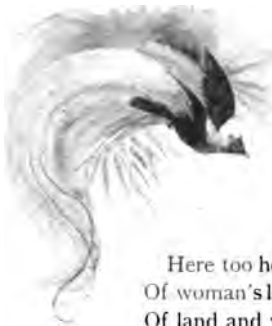
“THOSE GOLD- EN BIRDS.”

And the mosaic floor beneath shines through The sprinkling of that foun- tain's silvery dew, Like the wet, glistening shells, of every dye, That on the margin of the Red Sea lie.