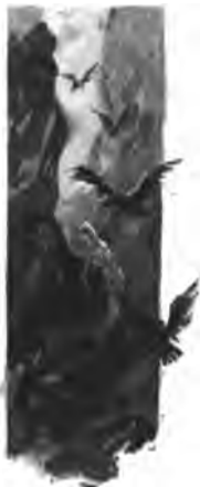
"A BANQUET, YET ALIVE, FOR FLOCKS OF RAVENING VULTURES."