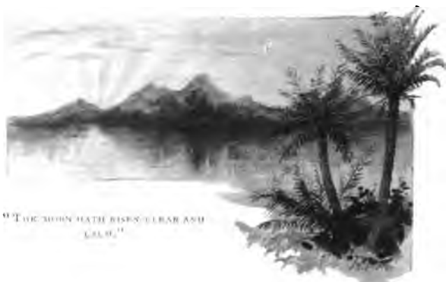
"THE MOON HATH RISEN CLEAR AND CALM."

THE morn hath risen clear and calm, And o'er the Green Sea* palely shines, Revealing BAHREIN'S† groves of palm, And lighting KISHMA'S‡ amber vines. Fresh smell the shores of ARABY, While breezes from the Indian Sea Blow round SELAMA'S‡ sainted cape, And curl the shining flood beneath,—