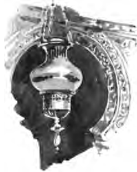
“ GAY, FLICKERING DEATH-LIGHTS.”

“ From reeking shrouds upon the rite looked out !