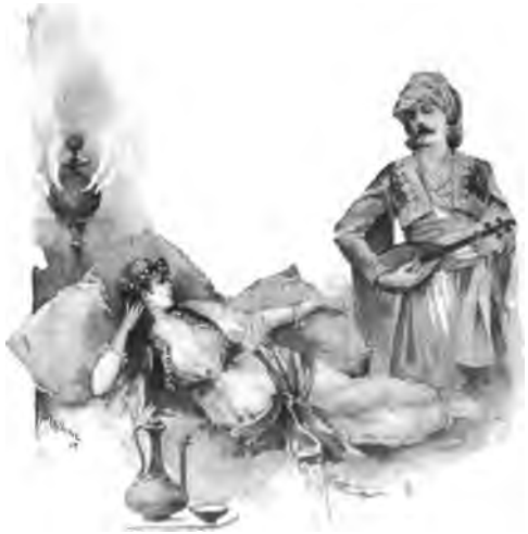
“THE YOUNG CASHMERIAN HELD IN HIS HAND A KITAR.”

covering that the cloth, which encircled his high Tartarian cap, was of the most delicate kind that the shawl-goats of Tibet supply.* Here and there, too, over his vest, which was confined by a flowered