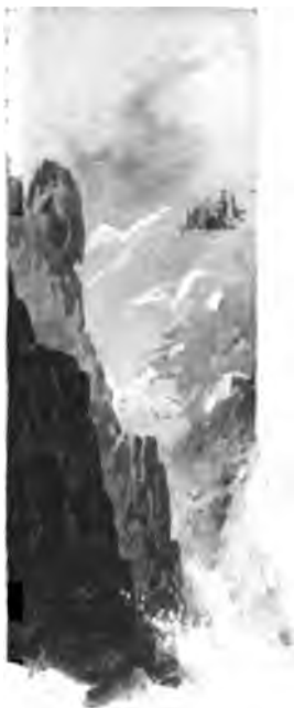
“ A ROCKY MOUNTAIN, BEETLING AW- FULLY.”

There stood — but one short league away From old HARMOZIA'S sultry bay— A rocky mountain, o'er the Sea Of OMAN beetling awful- ly;* A last and solitary link Of those stupendous chains that reach From the broad Caspian's reedy brink Down winding to the Green Sea beach. Around its base the bare rocks stood, Like naked giants, in the flood, As if to guard the Gulf across ;