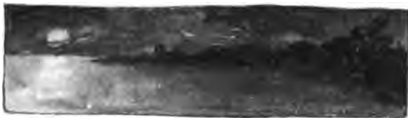
“TIS MOONLIGHT OVER OMAN'S SEA.”

The wind-tower on the EMIR'S dome* Can hardly win a breath from Heaven.