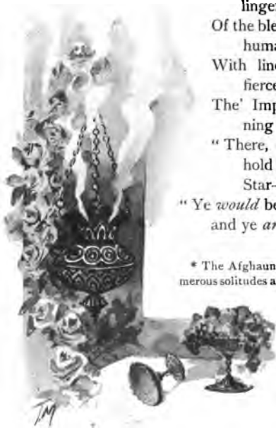
" RICH CENSERS BREATHING."

" Ye would be dupes and victims, and ye are .