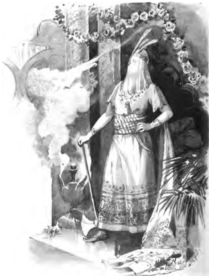
"THE GREAT MOKANNA."