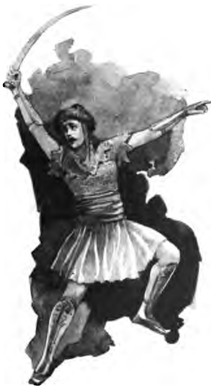
"RIGHT TOWARDS MOKANNA."

And every sword, true as o'er billows dim The needle tracks the load-star, following him !