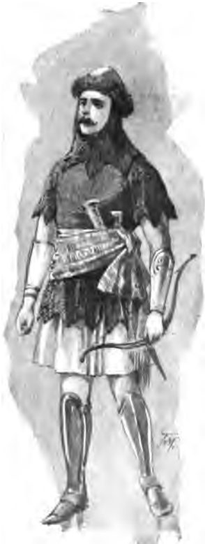
“YON WARRIOR YOUTH.”

* In the war of the Caliph Ma- hadi against the Empress Irene, for an account of which vide Gib- bon , vol. x.