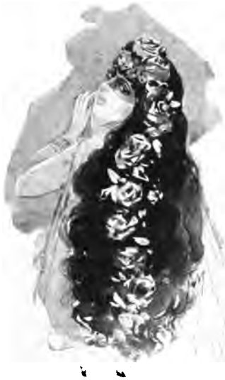
“UPON HER LONG BLACK HAIR.”

Gay creatures! sweet, though mournful, 'tis to see How each prefers a garland from that tree Which brings to mind her childhood's innocent day, And the dear fields and friendships far away.