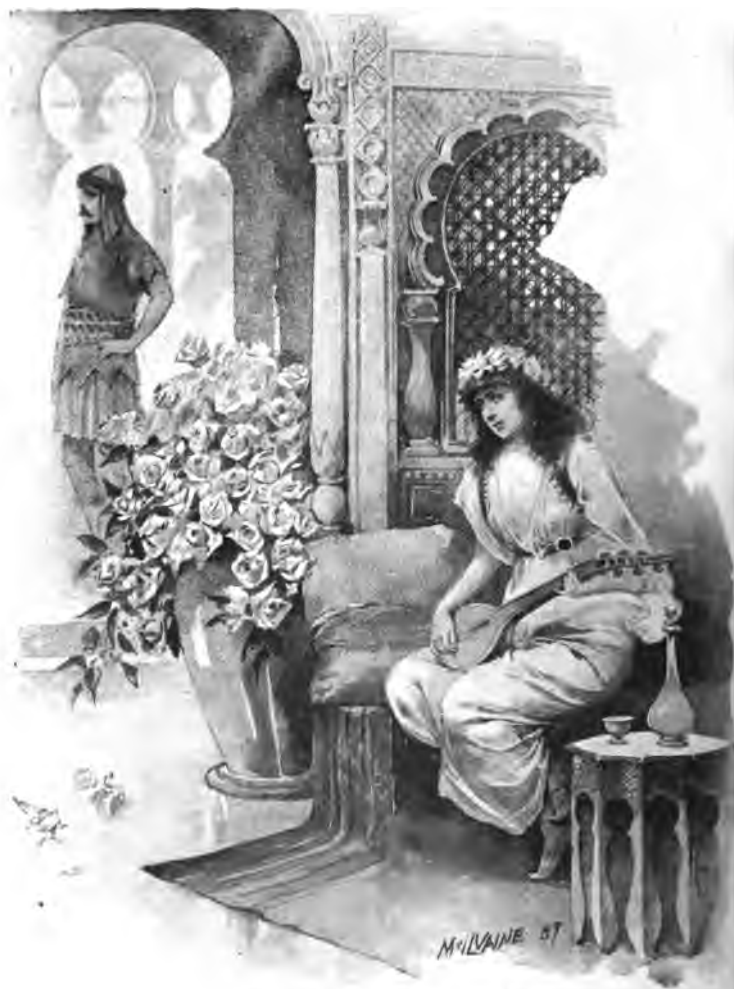
"TOUCHED A PRELUDE STRAIN."