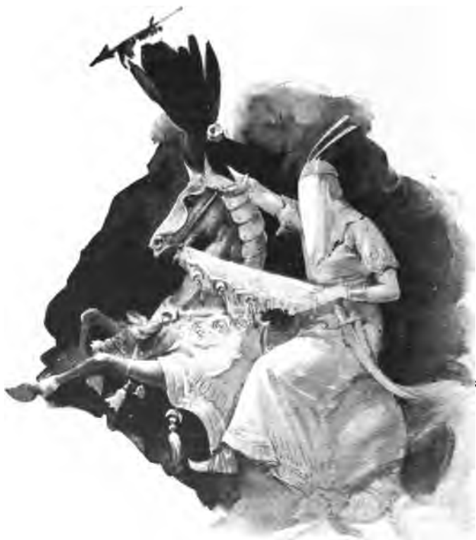
"MOKANNA'S SELF PLUCKS THE BLACK BANNER DOWN."