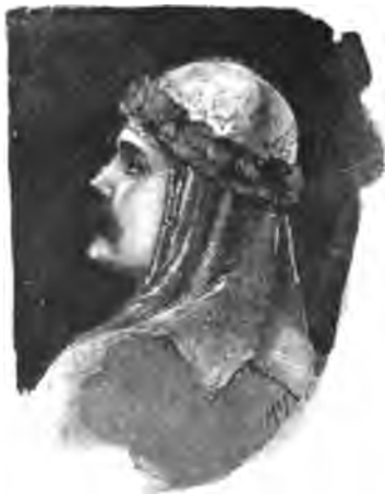
“YOUNG WARRIOR, WELCOME!”

“Man, in the sun- shine of the world’s new spring,