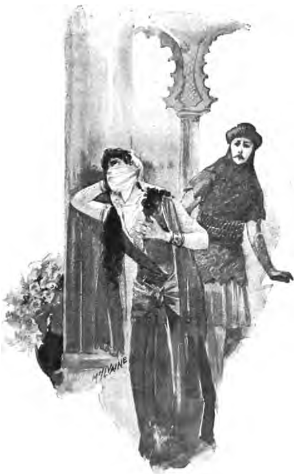
"AGAINST A PILLAR NEAR."