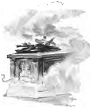
“HALF LIGHTED BY THE ALTAR'S FIRE.”

The few still left of those who swore To perish there, when hope was o'er— The few, to whom that couch of flame,