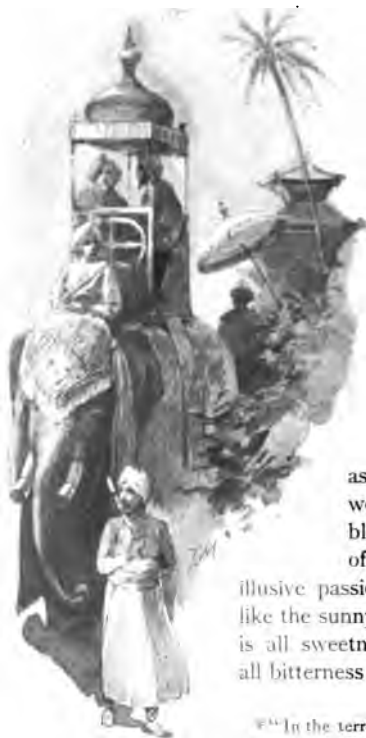
"THE GAY CAVALCADE."

LALLA ROOKH could think of nothing all day but the misery of these two young lovers. Her gaiety was gone, and she looked pensively even upon FADLADEEN. She felt, too, without knowing why, a sort of uneasy pleasure in imagining that AZIM must have been just such a youth as FERAMORZ ; just as worthy to enjoy all the blessings, without any of the pangs, of that