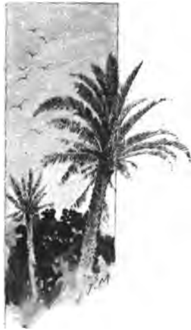
ABOUT THE GARDENS."

Of Hindostan,* whose holy warblings gush, At evening, from the tall pa- goda's top ;— Those golden birds that, in the spice-time, drop About the gardens, drunk with that sweet food† Whose scent hath lured them o'er the summer flood ;‡ And those that under Araby's soft sun Build their high nests of bud- ding cinnamon ;§ In short, all rare and beaute- ous things, that fly Through the pure element, here calmly lie