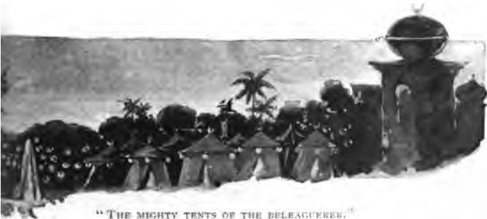
“THE MIGHTY TENTS OF THE BELEAGUERER.” †

A light like that with which hell-fire illumines The ghastly, writhing wretch whom it consumes !