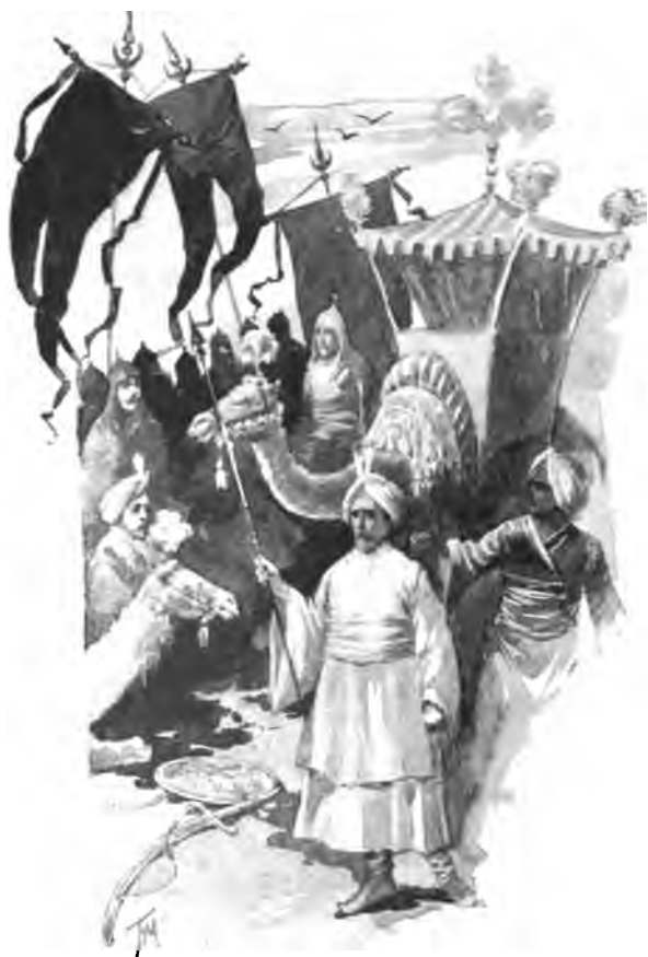
"THE CALIPH'S GLORIOUS ARMAMENT."