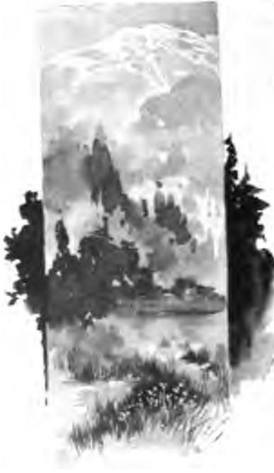
"WHOSE HEAD IN WINTRY GRANDEUR TOWERS."

Fair gardens, shining streams, with ranks Of golden melons on their banks, More golden where the sun- light falls;— Gay lizards, glit- tering on the walls* Of ruined shrines, busy and bright As they were all alive with light;— And, yet more splendid, nu- merous flocks Of pigeons, set- tling on the rocks, With their rich restless wings, that gleam