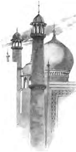
“FROM SYRIA’S THOUSAND MINARETS.”

Like a stray babe of Paradise, Just lighted on that flowery plain, And seeking for its home again.