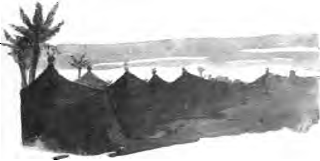
“THIS CITY OF WAR.”

WHOSE are the gilded tents that crowd the way Where all was waste and silent yesterday? This City of War which, in a few short hours, Hath sprung up here,* as if the magic powers