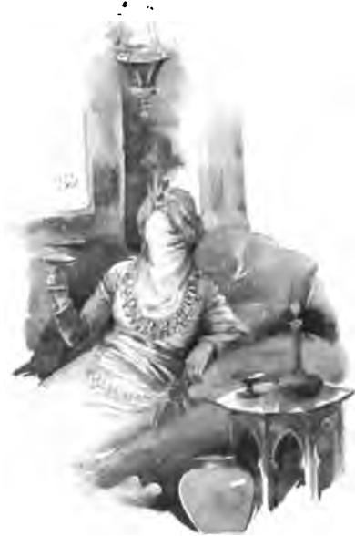
"UPON HIS COUCH THE VEILED MOKANNA LAY."

Where, pondering alone his impious schemes, MOKANNA waited her—too wrapped in dreams Of the fair-ripening future's rich success, To heed the sorrow, pale and spiritless, That sat upon his victim's downcast brow, Or mark how slow her step, how altered now From the quick, ardent Priestess, whose light bound Came like a spirit's o'er the' unechoing ground,—