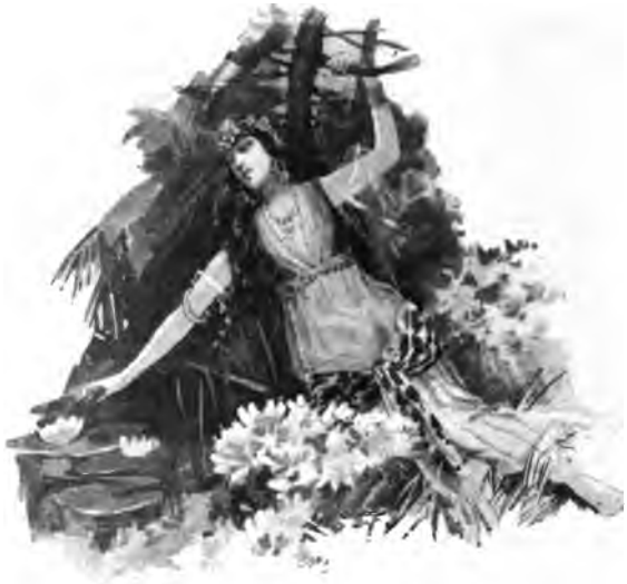
“HEAPS HER BASKETS WITH THE FLOWERS.”

Nor ever in aught earthly dip, But the morn's dew, her roseate lip. Filled with the cool, inspiring smell, The' Enchantress now begins her spell, Thus singing as she winds and weaves In mystic form the glittering leaves :---